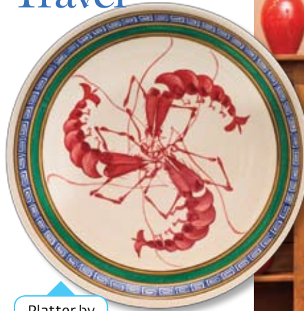
Platter by Will, $295

"I paint with calligraphy brushes." ~Will McCanless